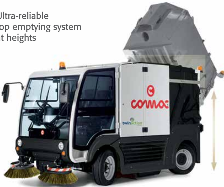
h 180 cm

Ultra-reliable top emptying system at heights