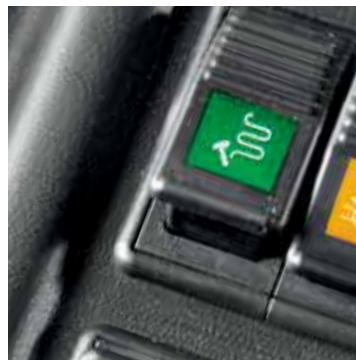
Button for activation of the filter shaking