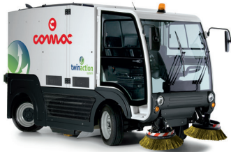
With 2 side brushes (standard)