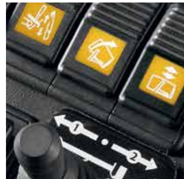
Hopper emptying buttons

The collection hopper is emptied by lifting it on vertical guides up to 180 cm.