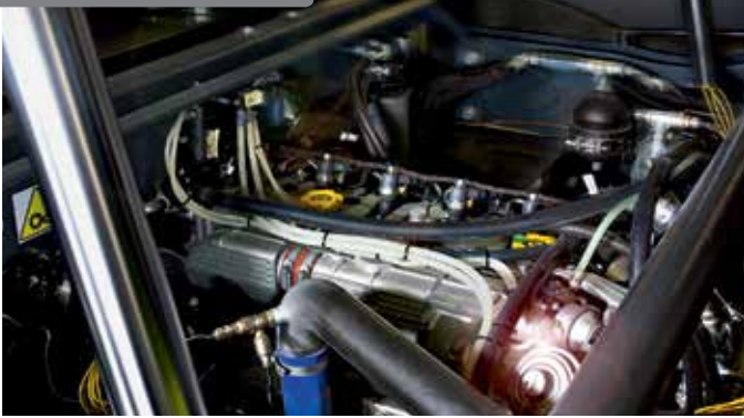
The VM R756 engine power is 140 hp