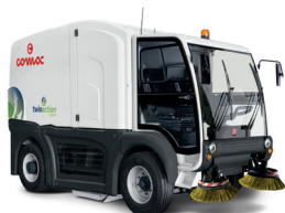
With 2 side brushes (standard)